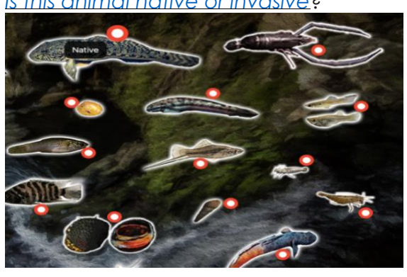
Kahoot!: <u>Spot the native!</u>